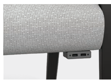
Power ports (optional)